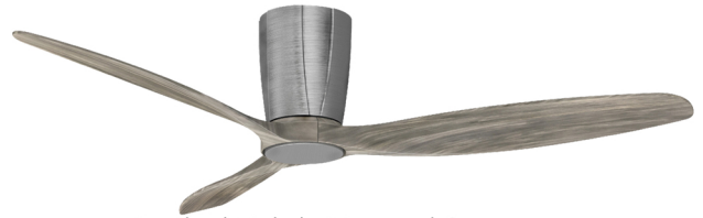
Brushed Nickel - Disressed Grey