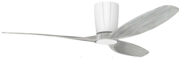
White - Seashore White