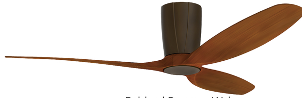
Rubbed Bronze - Walnut