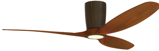
Rubbed Bronze - Walnut