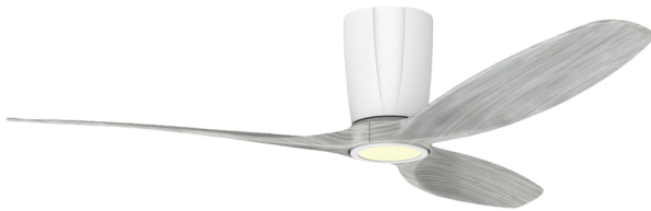
White - Seashore White