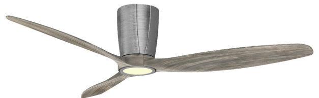
Brushed Nickel - Disressed Grey