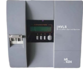
Wall control Box