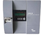
Wall control Box