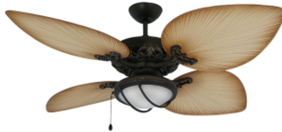
PHUKET SL ✨