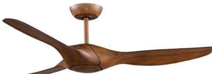
Aero - DK